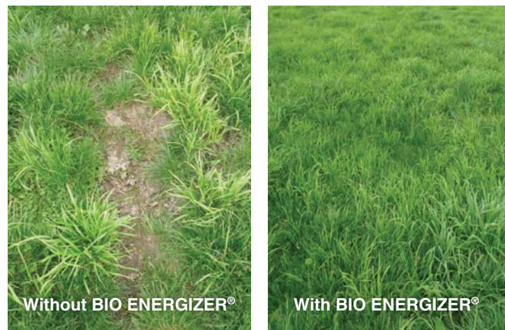
Irrigated Phalaris Grasses

The photos show the difference in the quality and thickness of the pasture, and the graph shows the increases in 5 of the prime nutrient values of the BIO ENERGIZER® treated water.